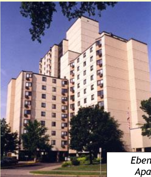
Ebenezer Park Apartments, Minneapolis.

The activity of the month was to find an apartment that was affordable based on a given income. The Hub students called Ebenezer Park Apartments using the video phone to schedule a tour with the manager. Ebenezer offers services for residents who are deaf, DeafBlind or hard of hearing. Once on-site the students had an opportunity to tour the apartment complex. They saw what a one and two bedroom apartment looked like, toured the laundry room, and asked questions about what was included with rent, such as utilities or cable TV. After the tour the students picked up several copies of rental applications. The students will learn how to fill out housing applications later this month.