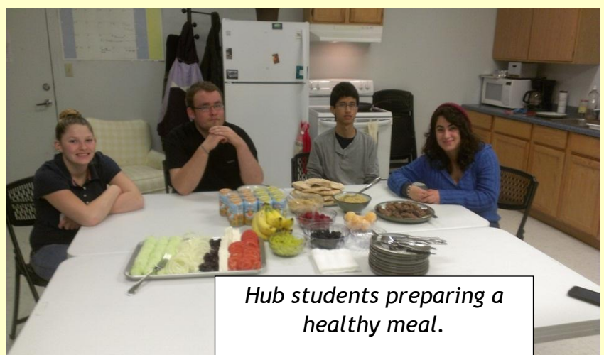
Hub students preparing a healthy meal.