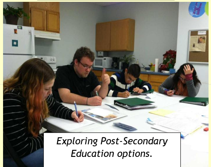
Exploring Post-Secondary Education options.