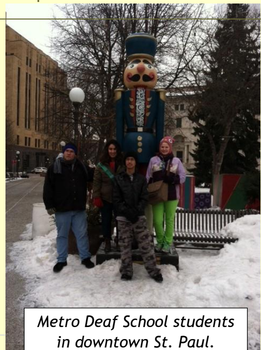
Metro Deaf School students in downtown St. Paul.

To get to places of interest throughout the Twin Cities such as the public library in downtown Minneapolis or the Landmark Center in St. Paul, the Hub students used the city bus for means of transportation. For both activities, the students had to plan the following: cost of bus fare, transfers, routes and time schedules. Once at the library the students learned how to check out, return library books and how to find a book of interest using the online library catalog system. While at the Landmark Center the students had the opportunity to take a tour of the inside of the building. Meanwhile, the students had an opportunity to interact with the pianist who was playing the grand piano on the main floor.