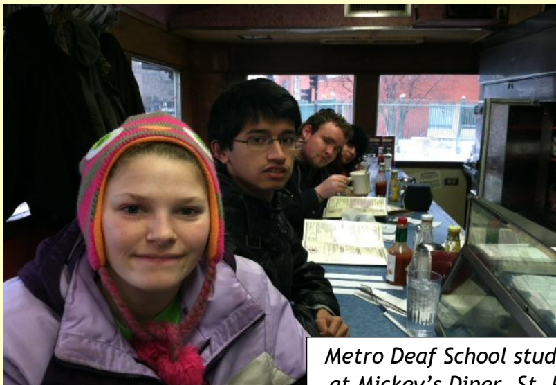
Metro Deaf School students at Mickey’s Diner, St. Paul

The students were out and about on the town frequenting different types of restaurants. Back by popular demand the students voted to return to the historical Mickey’s Diner in downtown St. Paul. For something new, the students also attended Buca di Beppo, a sit-down family style Italian restaurant in downtown Minneapolis. Before heading out to these places, the students learned how to make a reservation for a group of seven while using the videophone for communication. The students had the opportunity to put their additional learning to use such as; reading menus, determining meal prices, communicating directly with the wait staff, ordering off a menu, using appropriate table manners, making change when paying for meals and figuring in the cost of a tip. No one left the restaurant hungry!